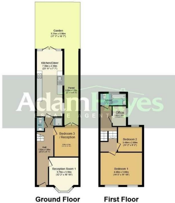
Ground Floor First Floor Total floor area 99.0 sq. m. (1,066 sq. ft.) approx This plan is for illustration purposes only and may not be representative of the property. Plan not to scale.